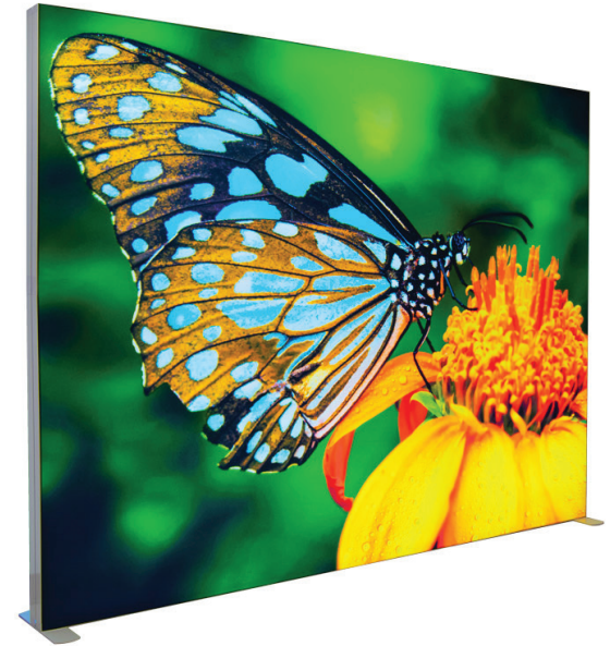
118" x 89"