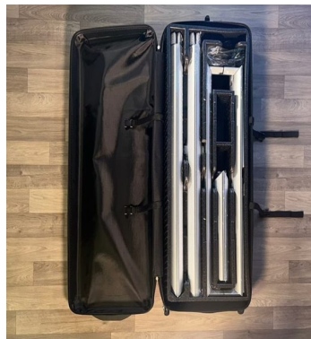
CA400 Hard Case Opened Showing Form Inserts