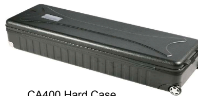
CA400 Hard Case